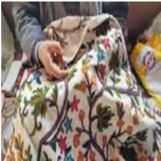
HAND EMBROIDERED CREWEL CURTAINS