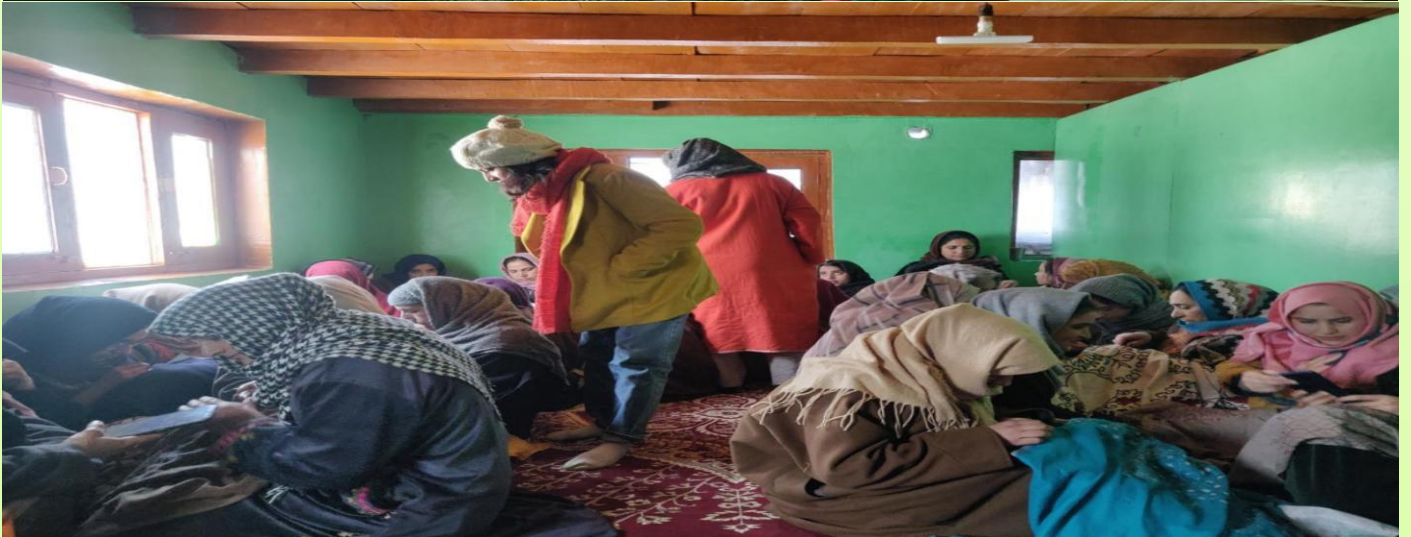
TWO DESIGN AND TECHNICAL DEVELOPMENT WORKSHOP VENUE: KUPWARA