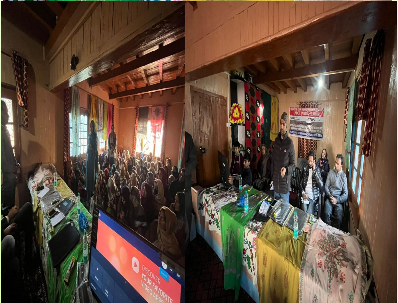
ENTREPRENEURSHIP DEVELOPMENT PROGRAMME AT MEELYAL & NEERUNBUTH