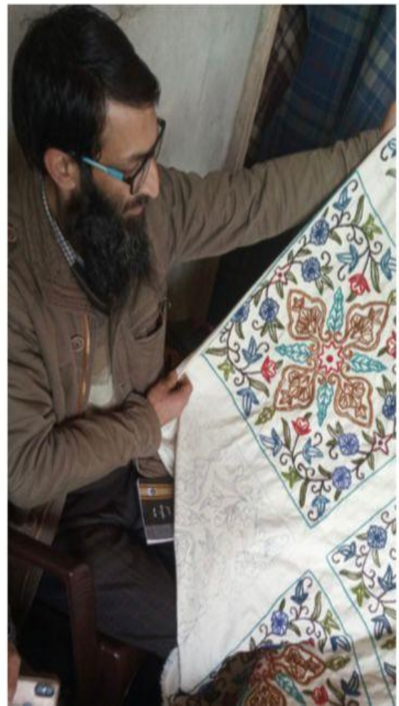
OTHER CREWEL PRODUCTS LIKE SLING, BAGS, POUCHES, TABLE COVERS ETC