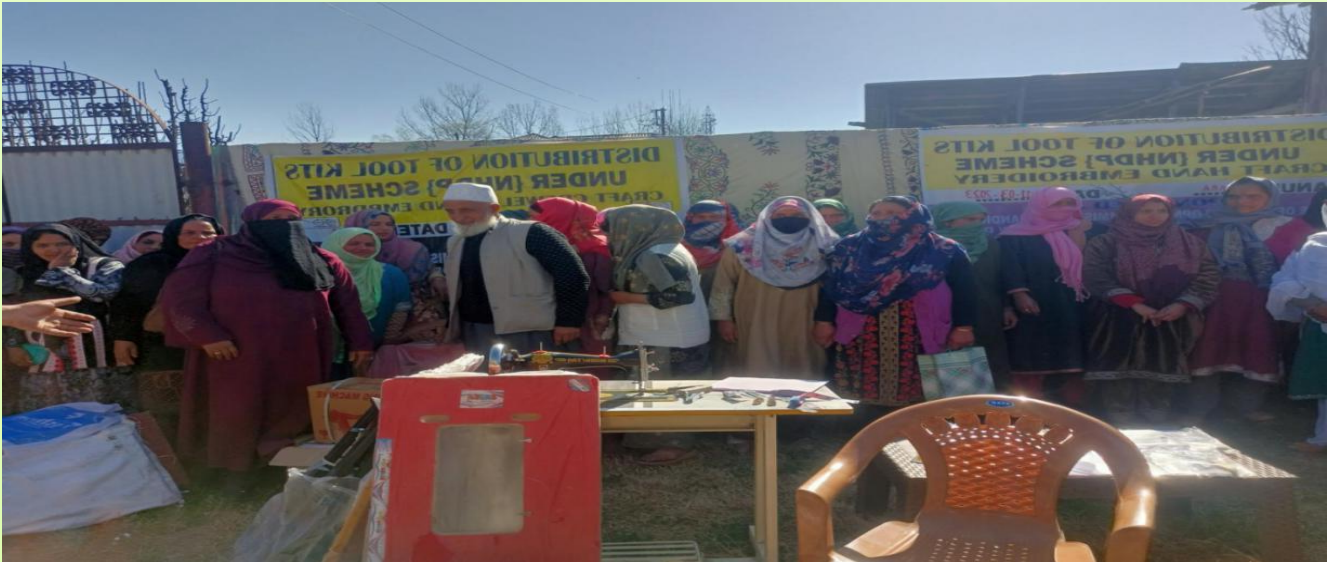
DISTRIBUTION OF TOOLKITS TO HANDICRAFT ARTISANS OF DISTRICT KUPWARA