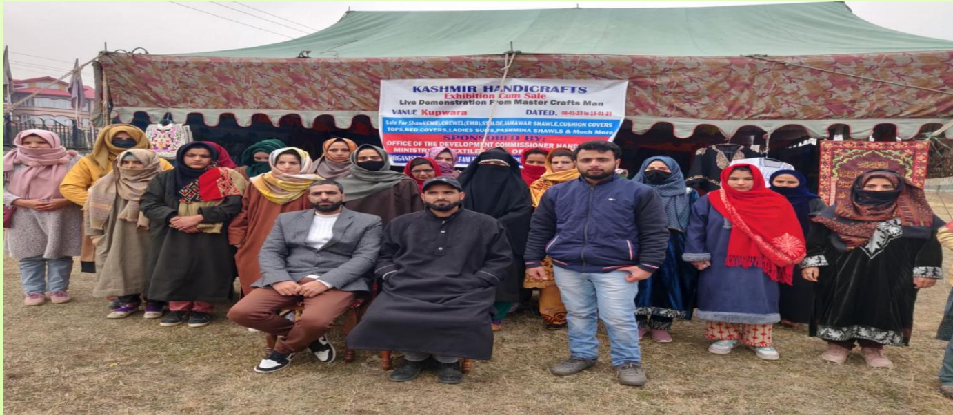
THEMATIC EXHIBITION AT KUPWARA